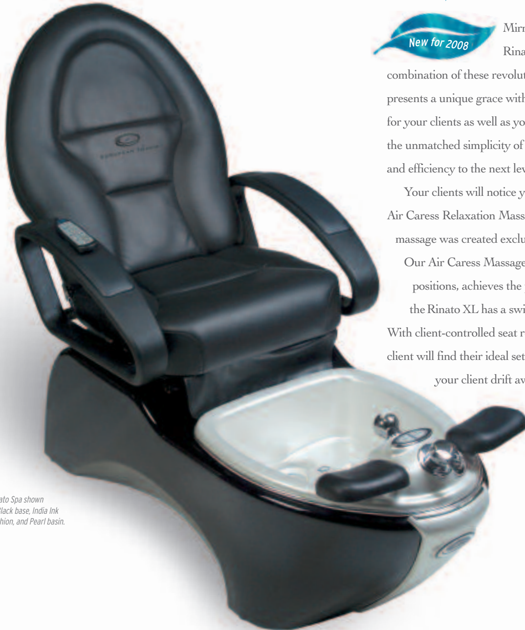
Rinato Spa shown in Black base, India Ink cushion, and Pearl basin.

With client-controlled seat recline, forward and back movement and massage settings, every client will find their ideal setting. For the ultimate pedicure experience, sound can be added to let your client drift away during their pedicure using their own portable music player. The result is the perfect experience that keeps clients coming back.