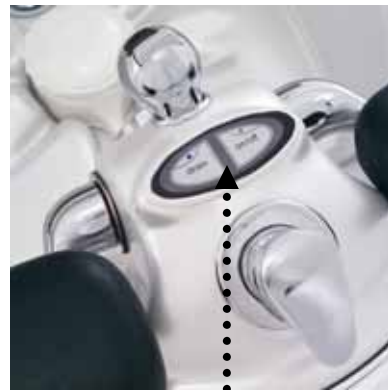
On/Off & Drain Button as with PDP option

Note: Pressing with finger nails, rather than the pads of fingers, will damage the on/off switch and will not be covered under the warranty.